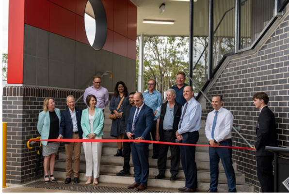
M Block Opening