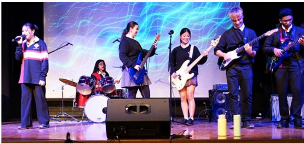
Annual Showcase event