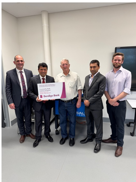
Bendigo Bank Board members providing support for M Block STEM equipment

Figures presented in this report may be subject to rounding so may not reconcile exactly with the bottom line totals, which are calculated without any rounding.