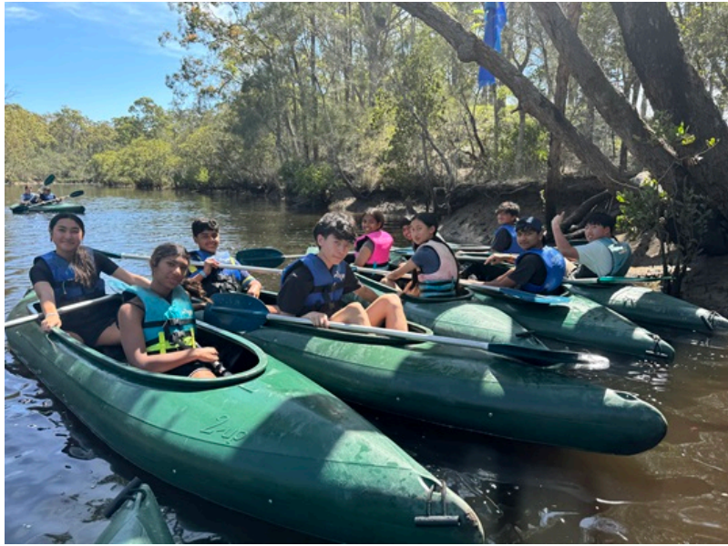
Year 9 students at Camp