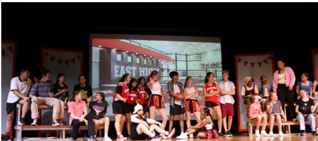
High School Musical cast members on stage Cherrybrook Technology High School 8592 (2024)

The implementation of a suite of new syllabuses, from 2023, will become a focus for the school and will involve significant resourcing around professional development of staff and relief time to develop new programs in line with changes made.