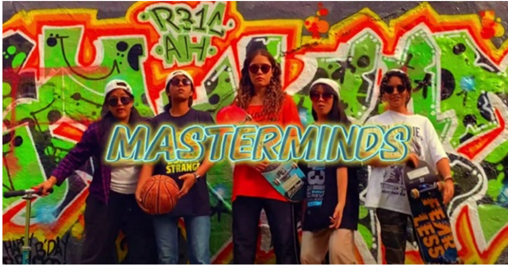
CTHS Game Changer team

A focus of professional learning, to be undertaken by all teaching staff in 2025, will be on building these above foundational skills in our students.