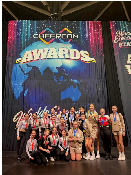
Representative Dance, Scorpions and Redback Cheer groups at competition