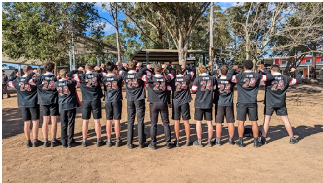
Year 12 Jersey design, incorporating Aboriginal motif

CTHS continues to support our sister school, the Smiling Hearts Association Cambodia (SHAC) through it's annual TriviaNight and donations. Located in SiemReap, Cambodia, SHAC is an entirely charity supported school that has been providing an education to Cambodian children since 2010. SHAC helps with the education of children in Cambodia and heavily relies on donations to succeed with their teaching. Solely on ticket sales and donations, the school was able to raise $1,600 for SHAC, which was warmly received. The School is looking forward to raising even more from the TriviaNight event in 2025.