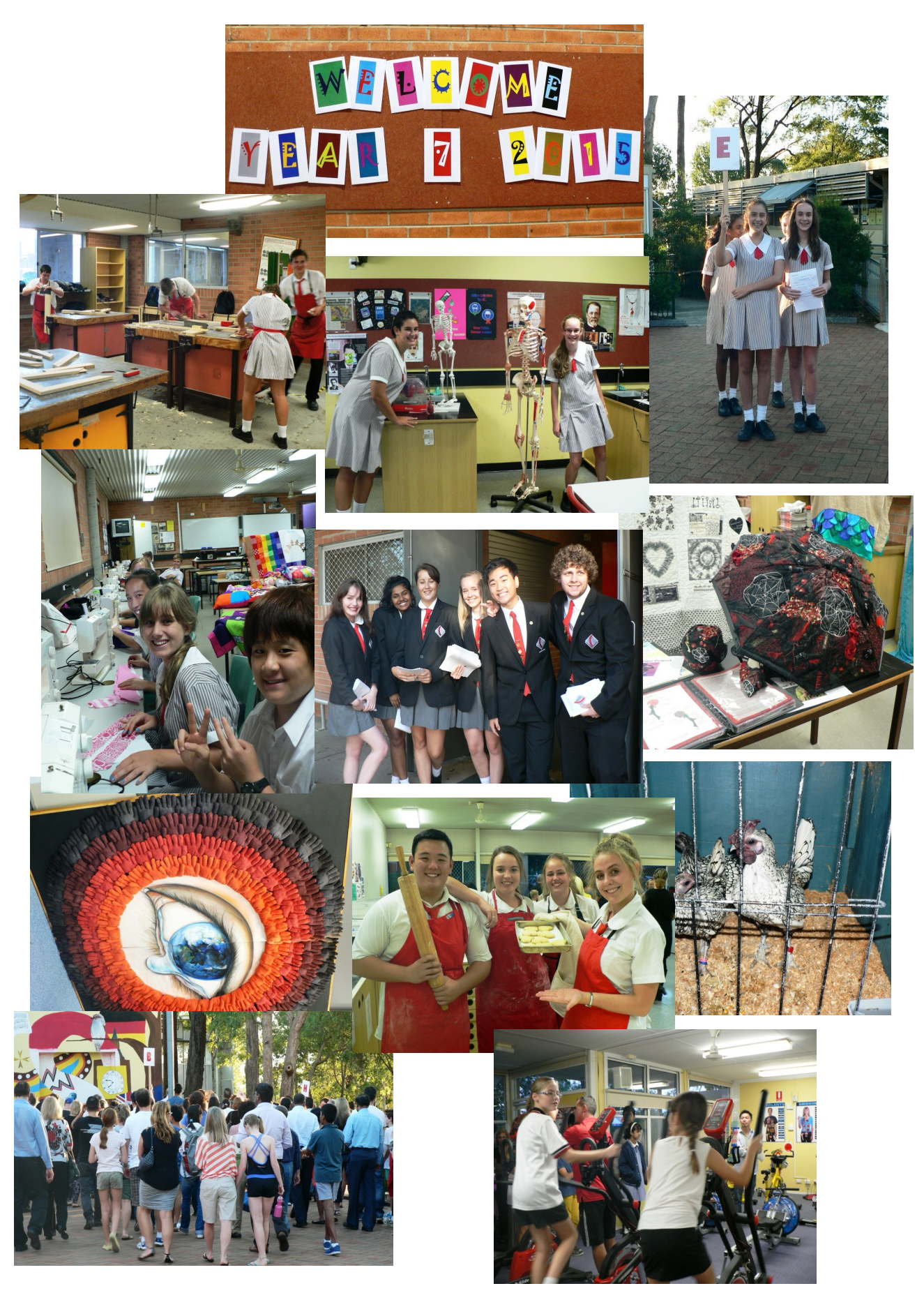
Year 6 into 7 open night