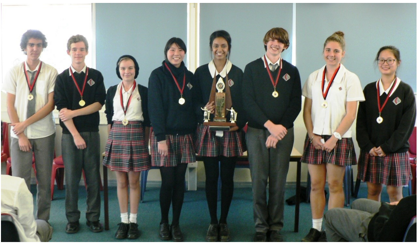
Year 10 Public Speakers

Thank you to the finalists, the class contestants and the teachers who support this initiative that furthers the speaking skills of our next generation of students.