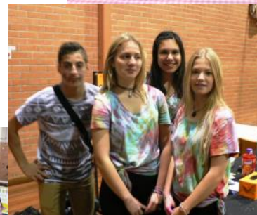
Stage 5 Market Day