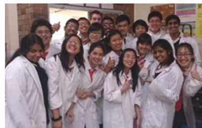
Year 12 NSW Schools Titration Competition 2014