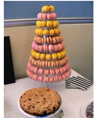
Canteen and School Volunteers' Luncheon