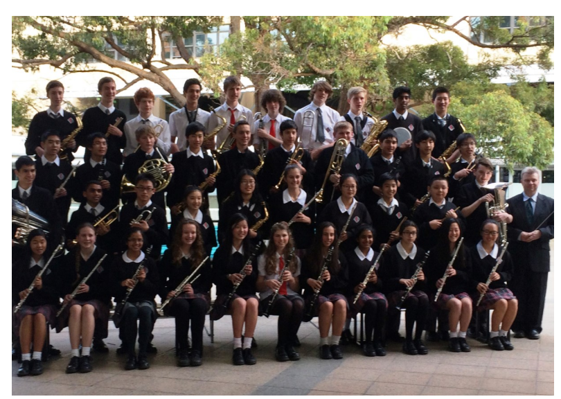
Concert Band 1