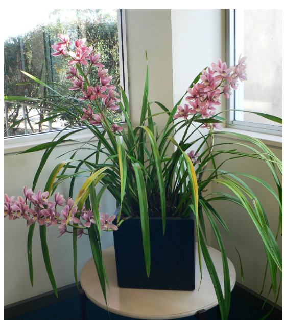
Orchid displays in the front foyer