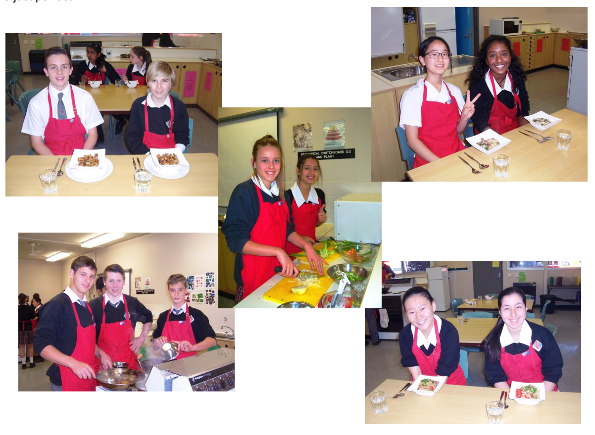
Year 11 Food Technology students have been learning about nutrition and the importance of the six nutrients in our diet. This week we made Zucchini and Date Muffins and Banana Bread which used All Bran as a main ingredient. Both were excellent examples of high fibre snack foods.

Students in Year 8 have been researching the many different Asian ingredients used in stir fry recipes. They then created their own recipes. However, just like in the Goldilocks story, some used far too much chilli paste, others not nearly enough soy sauce, while others were just perfect!