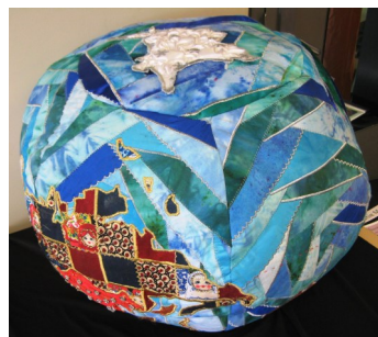
HSC Textile Major Projects