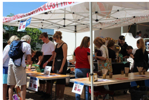
CTHS Coffee Shop at the Inala Fair