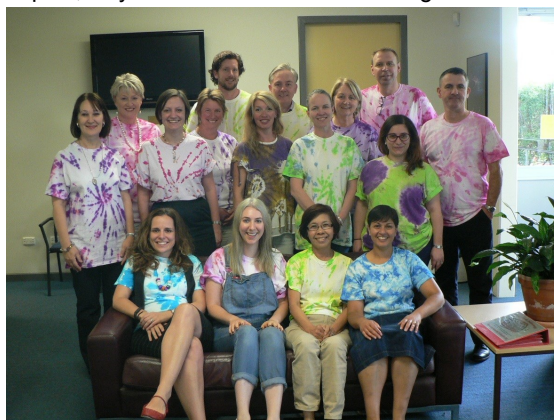
Staff wearing their tie-dyed tee shirts

Wednesday proved to be a great day for school spirit with a terrific mufti day organised and run very efficiently by our wonderful school SRC. Students were resplendent in a variety of outfits that showcased 'tie-dyed shirts'. Not only did our students have a fun day with the SRC actually dying and distributing nearly 400 shirts, significant funds were also raised for the Cure Brain Cancer Foundation, Westmead Children's Hospital, Beyond Blue and the Guide Dogs association; four most worthy causes.