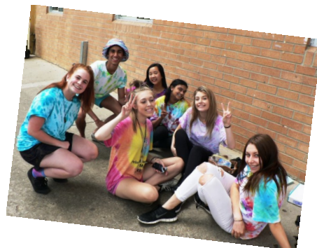
Tie-Dye Mufti Day