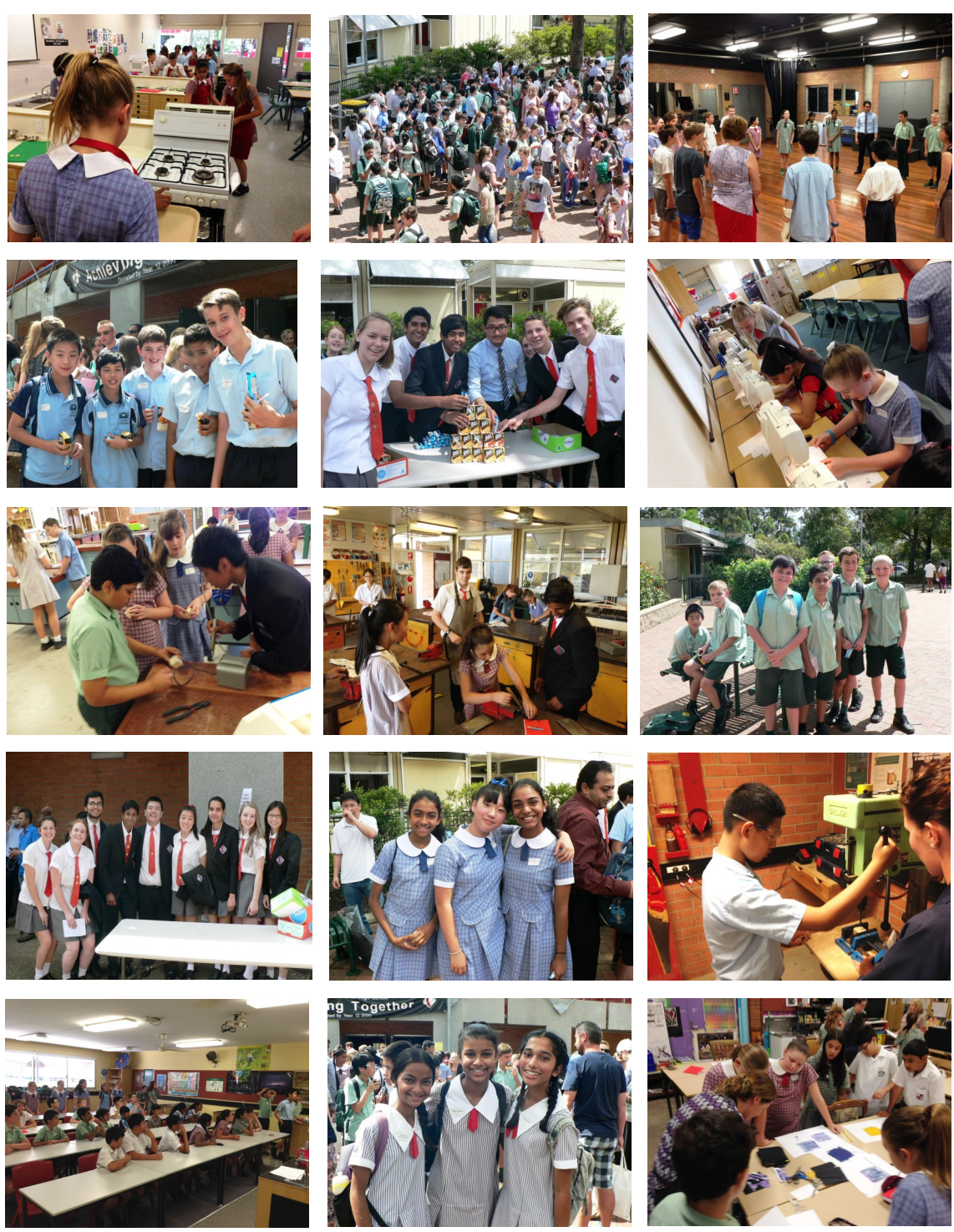
Year 6 into 7 Orientation Day