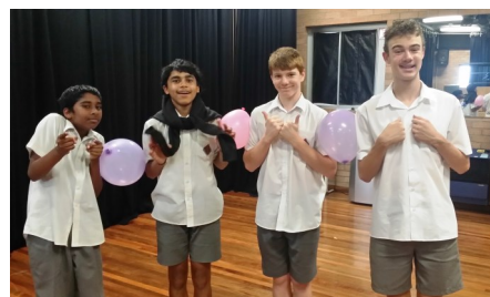
'Servant of Two Masters' Rehearsals