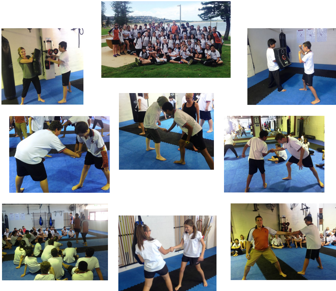
Rock and Water