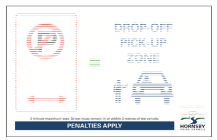
Above: No Parking = Drop-off Pick-up zone corflute sign

A new sign to inform parents and other road users about the benefits of the No Parking zone. These signs are designed to be attached to the school fence within the No Parking zones around schools. When managed effectively by the school community, No Parking zones can provide a safe and effective way to deliver and pick-up children from school. These will be installed by Council where possible on school fences when ordered. Please note: Some roads, particularly cul-de-sacs, may not be suitable for large scale passenger drop-off and pick-up. In such cases the length of drop-off and pick-up zones will be limited if they are provided.