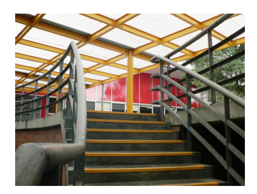
Replacement of fibreglass roofing