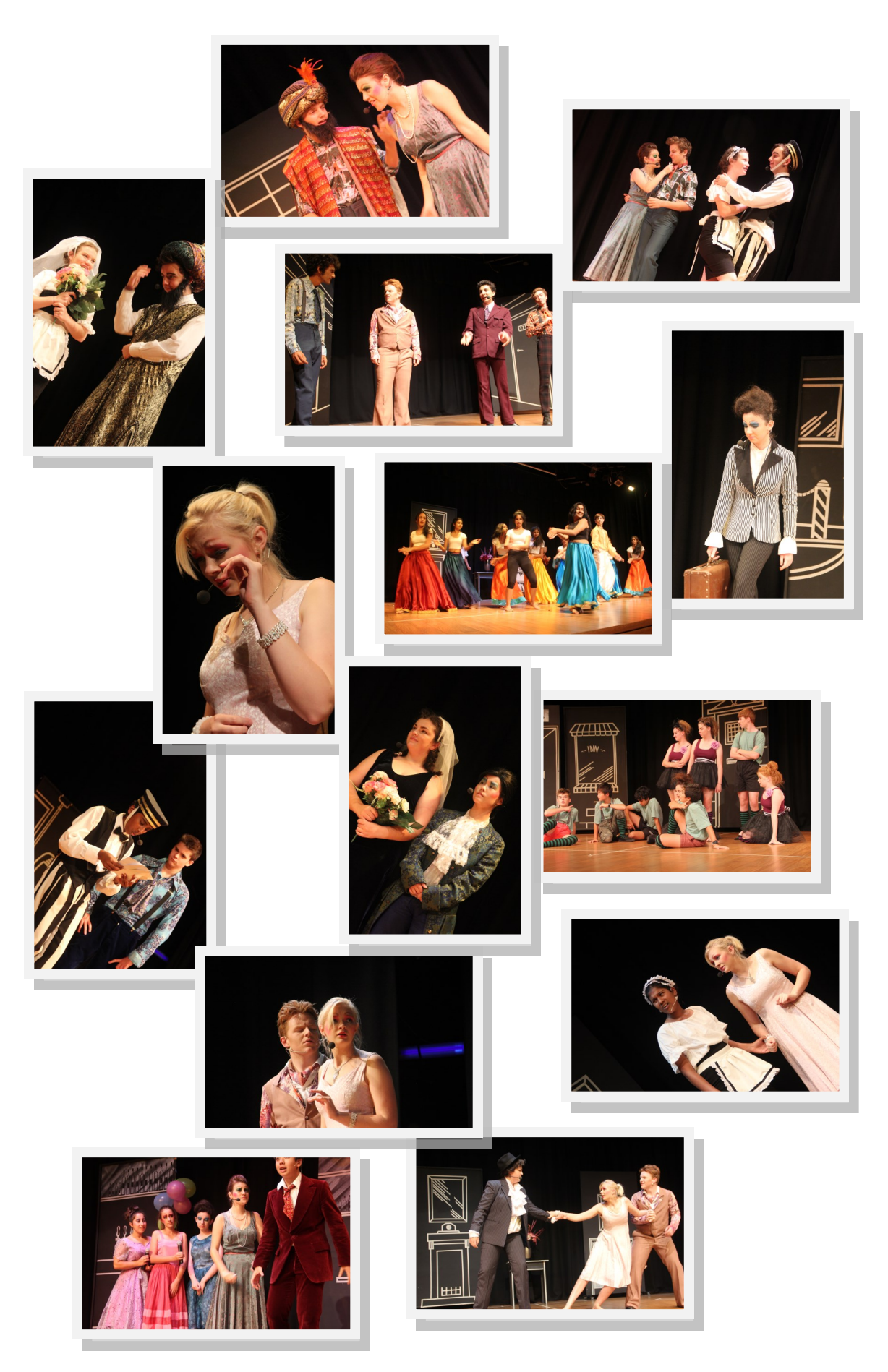
The Servant of Two Masters