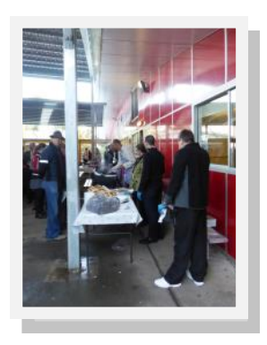
ANZAC Day Dawn Service