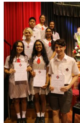
Sports Awards Assembly