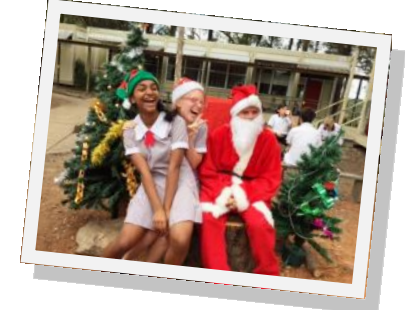
SRC/Social Justice fundraiser