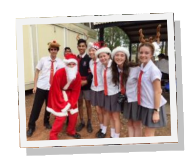
End of Year Activities