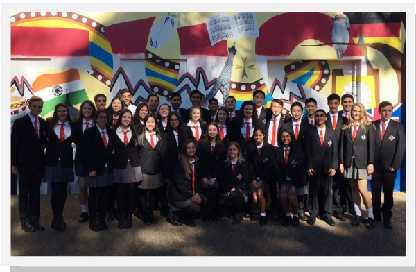
School Leaders for 2016-2017

Friday's School Leadership Induction Assembly signalled the handover from the 2015-16 Executive to the newly elected 2016-17 group. This highly symbolic event seeks to recognise the efforts of the outgoing group, which has been amongst the finest in terms of their role modelling, academic success and innovation as leaders. It also provides the opportunity for the incoming group to set lofty goals as their successors. I have every confidence the new group will bring their own distinctive flavour to this role with their own innovative ideas.