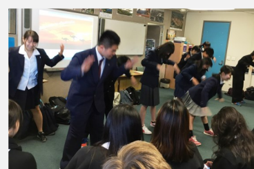
Japanese Visitors with our students and teachers