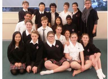
Year 8 Drama Ensemble

"It was one of the best performances I have ever been part of and also one of the best theatres I have ever been at and had the honour to perform in! The sheer size and lighting made our piece feel very unique and special. I really liked the teamwork, working with the other Stage 5 drama students as well as the Year 11 drama students to make our work entitled, Fandoms , a masterpiece."