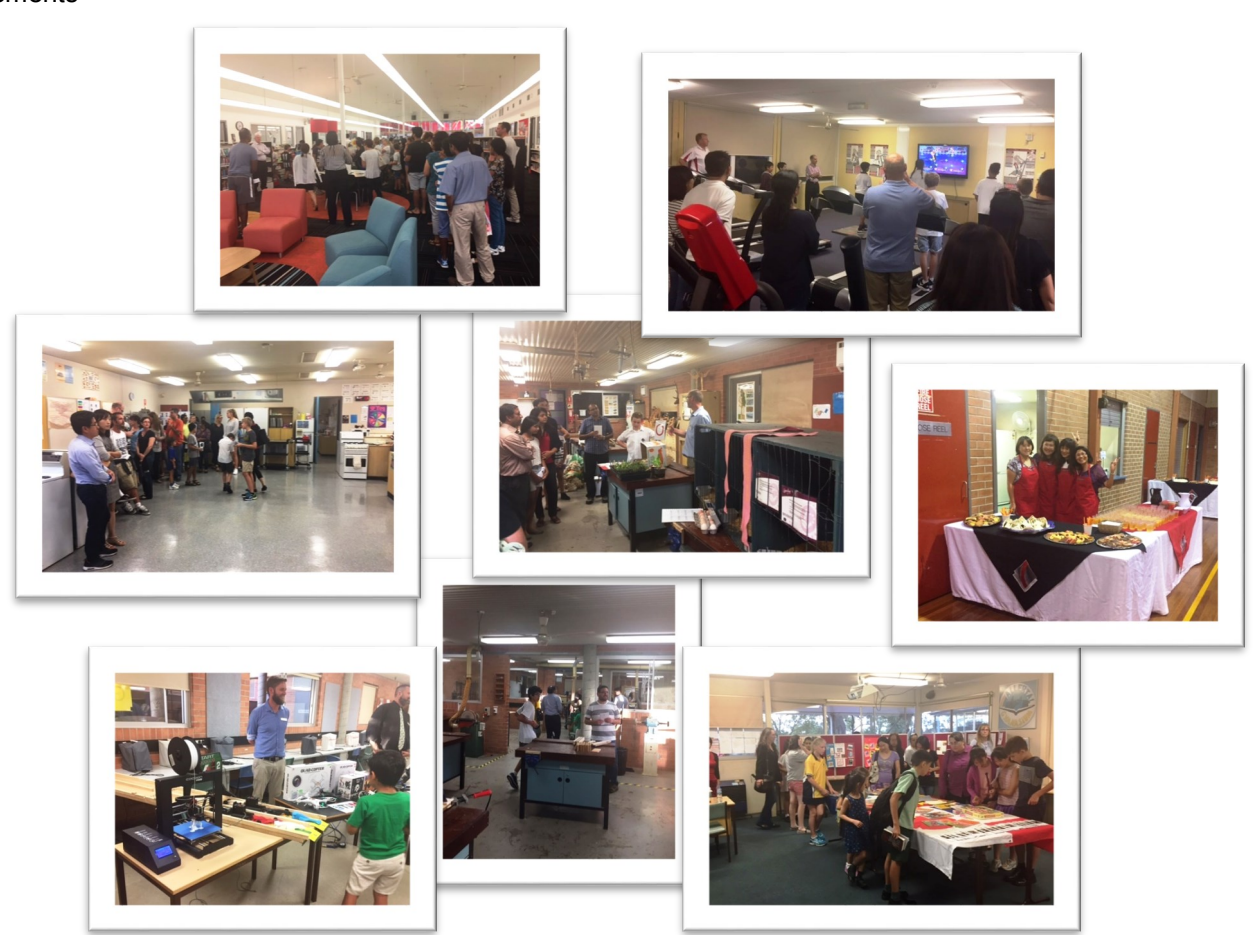
Year 6 into 7 Information Night