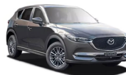
Mazda CX-5 Touring Auto 2.5i AWD

Quoted prices include: Finance Rego+Insurance Fuel Maintenance