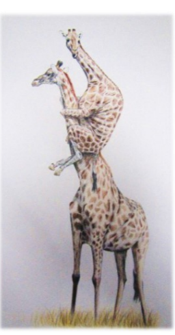
By Jade Hsu