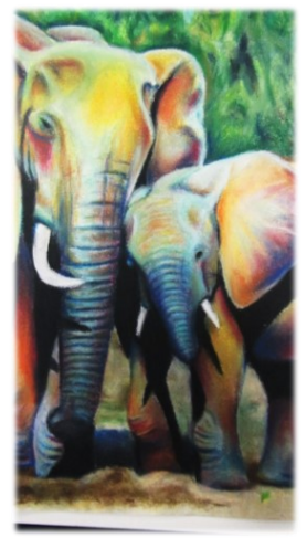
By Amy Hill