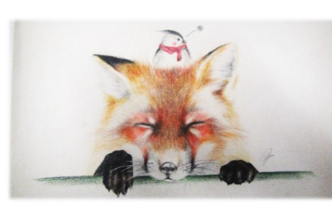
By Yvonne Huang