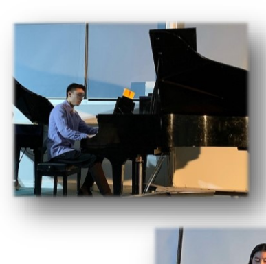
Year 12 Music Performances