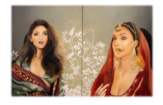
HSC Industrial Technology Major Works