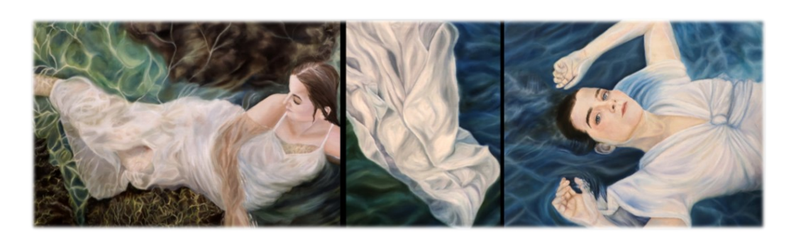
Highly Commended, Delene Saverimuttu